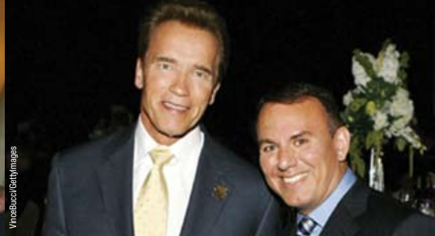
Governor Arnold Schwarzenegger commends BQ for raising $500,000 for Sheriff Lee Baca's Youth Foundation.